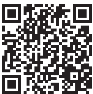
Scan To Find A Lubricant Cross

Quality is our brand promise. When you partner with SA Performance you gain a trusted partner committed to your own success. Let our experience in the air compressor market work for you.